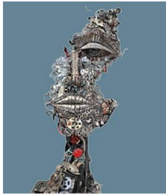
Figure 5: Human Face', 3.5ms X 1.5ms X 1m, Scrap Metal, 2024

remarkable understanding of using scarp pieces at the best and most suitable place to get maximum advantage. The human face created by him is one of his most unique works of art. Each part of the face has been created with great beauty, simplicity and skill. The eye of the face is showing spirituality as if he is dreaming a blissful dream. The lips have been shown in a very good way. The slight smile on the lips expresses his spiritual happiness. The sculptor has described the unique feeling in the tender heart of man very earnestly. (Figure: 5)