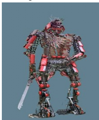
Figure 4: 'Robot', 5ms X 1.5ms X 1.5ms, Scrap Metal, 2023