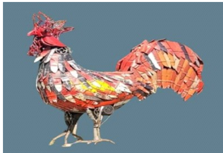
Figure 2: ‘Rooster’, 3ms X 1m X 2ms, Scrap Metal, 2024

Rooster: The sculpture of a rooster made by Polly is one of his masterpiece sculptures. The special thing about this sculpture is that its wings are not painted after making the sculpture, but the sculptor uses colored scrap pieces which gives the illusion of a real rooster. The rooster does not only convey the message to the people to stay awake, but also inspires them to fulfill their responsibilities on time. (Figure: 2)